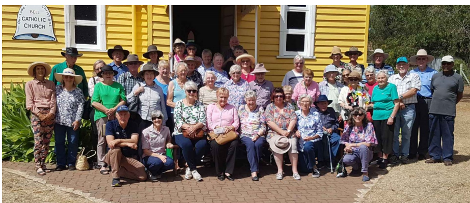
The Bell Bus Tour group outside the Bell Catholic Church on the grounds of the Bell Biblical Gardens