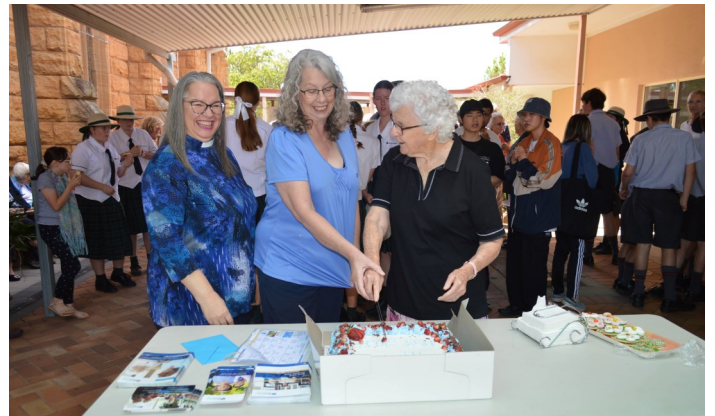
Celebrating 70 years of Blue Care and the Wesley Indoor Bowls Club

A huge thankyou to our Who Cares (Church) Catering team for organising the Hawaiian Night which was such fun while raising money for a defibrillator. A good social night and good to see people we have not seen for a while as well as some new faces.